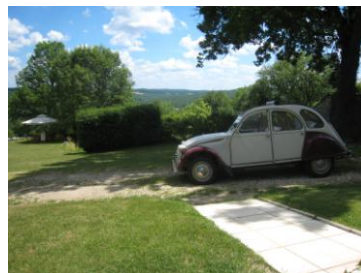
A few images from the last few weeks including artists at work & play, Susie's exhibition in Prayszac, the garden and the 2CV